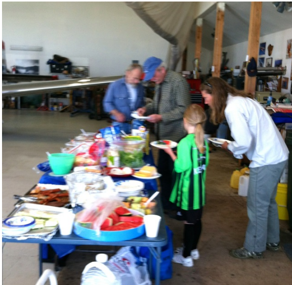
As usual, there was no lack of food!

The annual joint picnic between the Alaska and Mat-Su Valley Chapters was held on Wednesday, June 11, 2014 at the Hancock Hangar at Birchwood Airport. Members and guests from both chapters made the picnic a success!